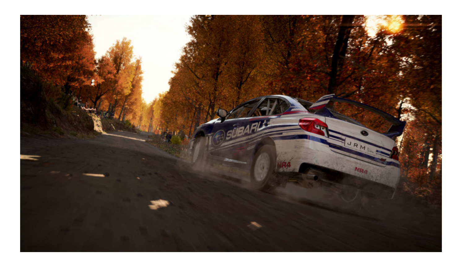
DiRT 4 Activation Code [serial Number]

Download ->>->> <a href="http://bit.ly/2SItVO6">http://bit.ly/2SItVO6</a>